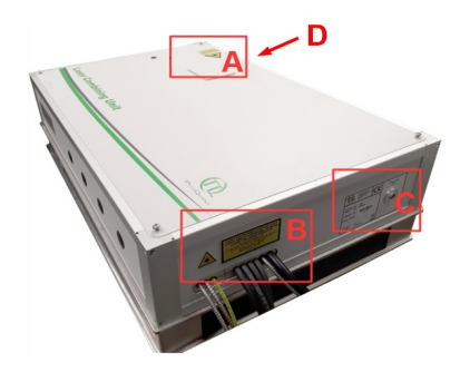
Fig. 1.1 Laser Combining Unit with Laser Warning Labels

PicoQuant equipment is clearly labeled with warnings about the equipment radiation level. All warning labels must be read and understood by personnel before working with the equipment. Be sure to observe the following warnings when operating a product equipped with a laser device. Failure to observe these warnings could result in fire, bodily injury and damage to the equipment.